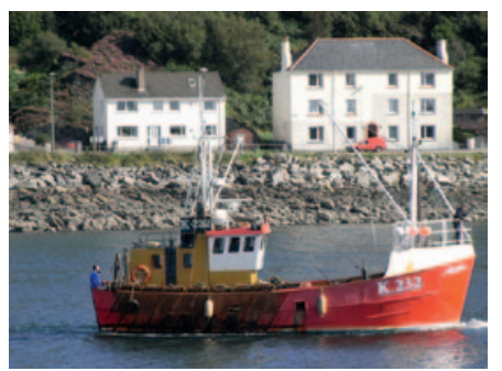
scot.gr/cp - scot.gr/co - scot.gr/cq