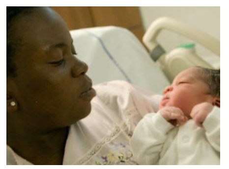
scot.gr/da - SGP - scot.gr/d9