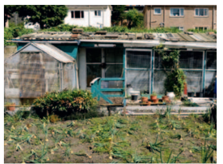
scot.gr/cz - scot.gr/d0 - scot.gr/d1