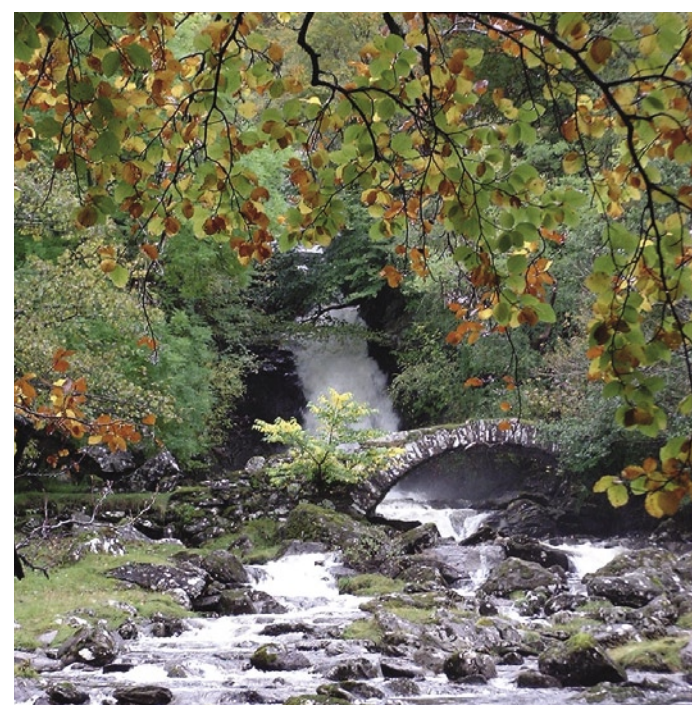
Rural Scotland is one of our strongest economic assets.

• We will increase native woodland cover to 20% by 2010, 25% by 2020 and 40% by 2050, and ensure the restructuring of monoculture exotic plantations into mixed native woodlands. We will encourage management of woodland to grow quality timber for use by future generations in building and construction and to reduce our impact on other countries' forests. Short-rotation coppicing for biomass will be supported where accredited sustainable management is in place.