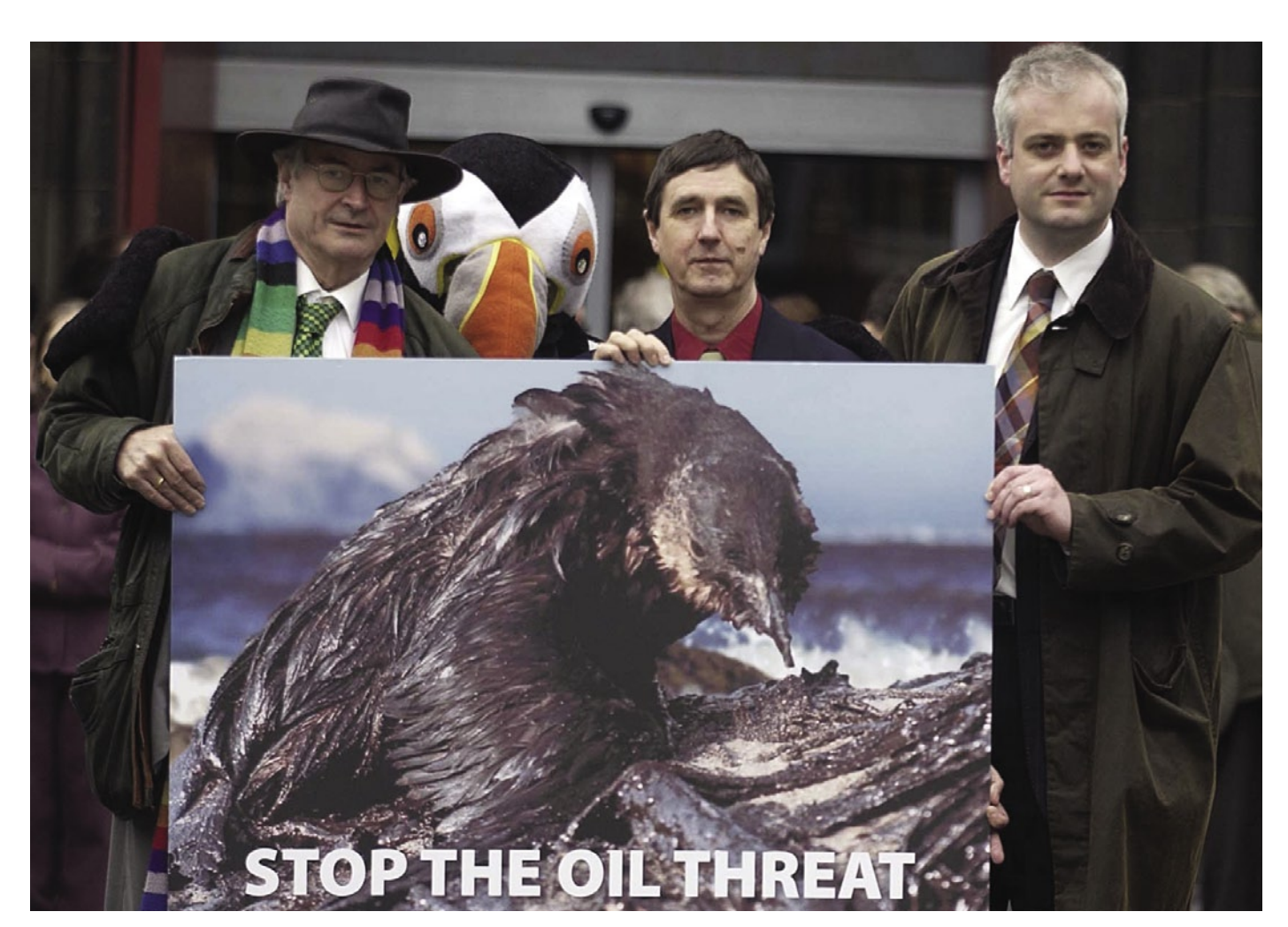
Green \, MSPs \, led \, the \, campaign \, to \, stop \, the \, ship-to-ship \, oil \, transfer \, scheme \, for \, the \, Firth \, of \, Forth \, and \, propose \, legislation \, to \, block \, it.